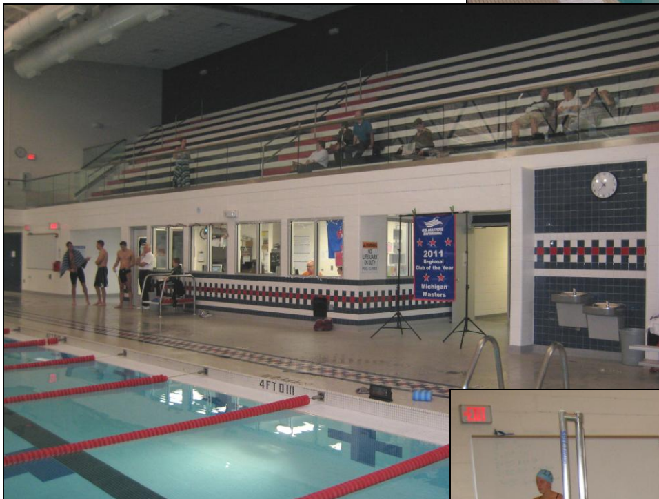
Turn end of the pool, pool office, locker room entrances on either side of the office, spectator seating above